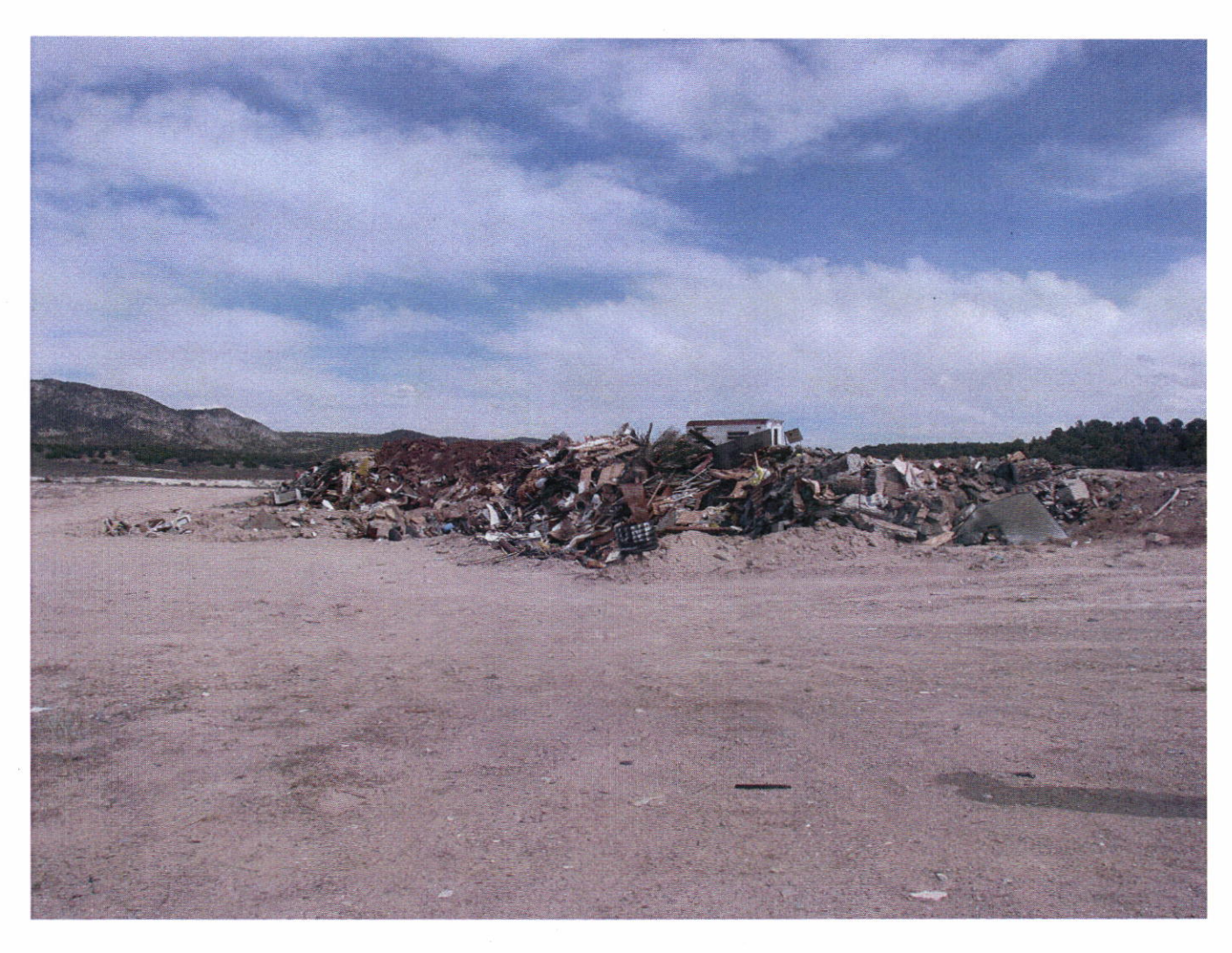
Looking east at the working face of the construction and demolition waste cell